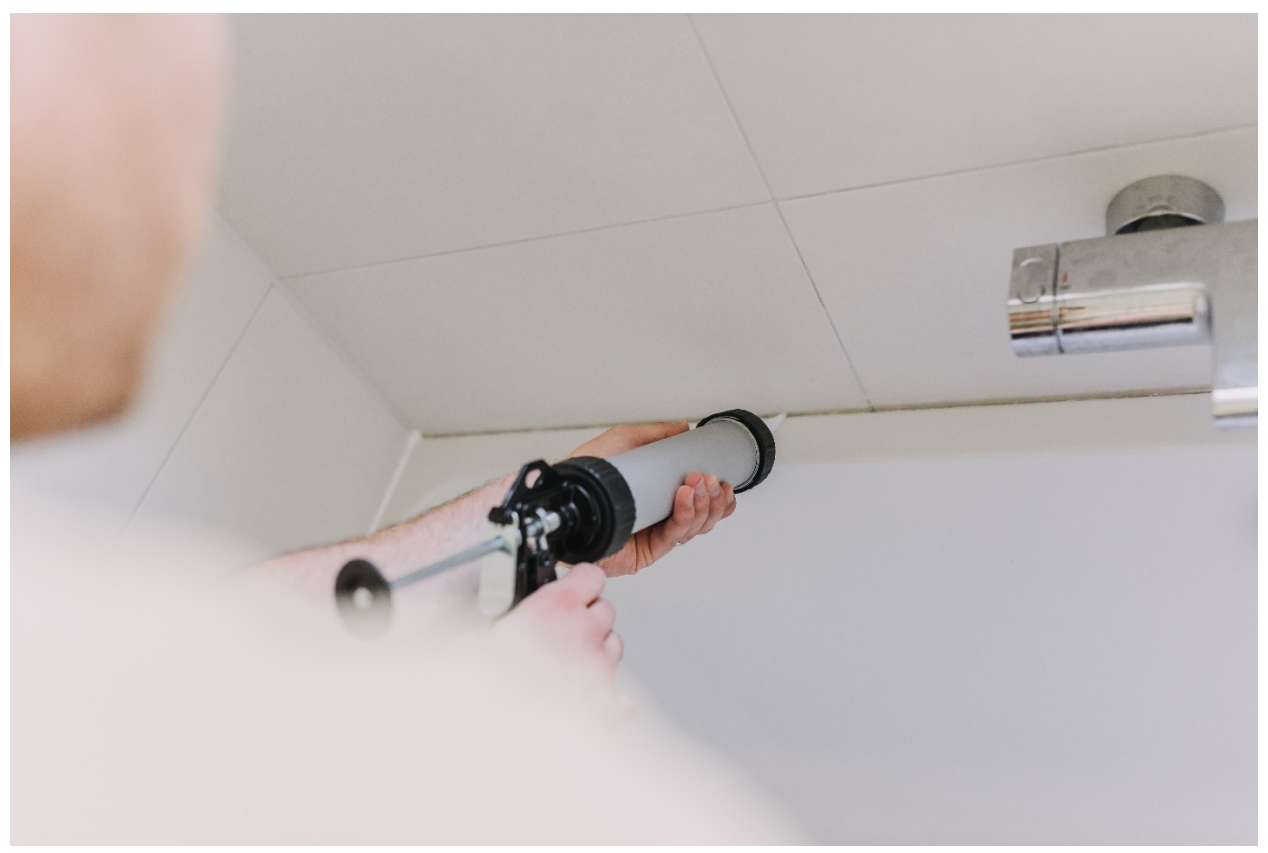
Figure 5. Sealing exterior and interior gaps provides multiple layers of exclusion.

1. Seal gaps of 1/4-inch or more with siliconized acrylic latex or polyurethane sealant products that stretch as gaps and cracks in buildings expand and contract due to temperature changes and other factors. Steel wool, foam fillers alone are not recommended for larger holes and cracks beyond serving as a quick temporary fix. They should be filled with good quality concrete, or stuffed with Xcluder® cloth then sealed with a siliconized acrylic latex or polyurethane sealant (Figure 6).