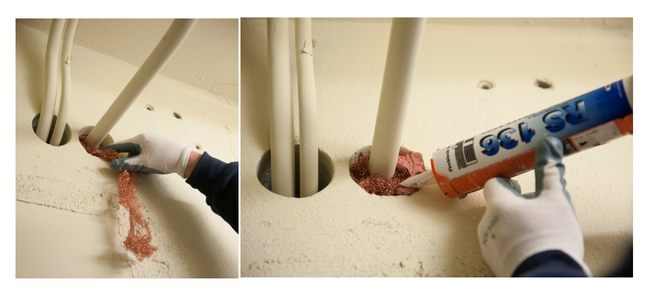
Figure 6. Sealing around conduits penetrating walls. Stuff gaps with Xcluder® cloth then seal with a siliconized acrylic latex or polyurethane sealant.