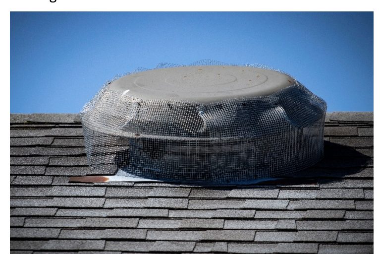
Figure 9. Exterior mesh on attic vents preventing entry of pests.