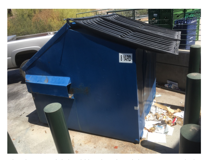
Figure 11. This dumpster lid should be closed, and the area around cleaned.

8. Encourage residents to reduce clutter in their homes and and don't allow clutter to build up in common areas or in on-site offices (Figure 12). Pest management profesionals and housing staff conducting visits can not see what pests are present.