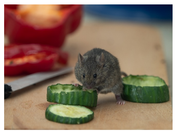
Figure 3. House mice eat human food and contaminate food and kitchen surfaces with urine and feces.