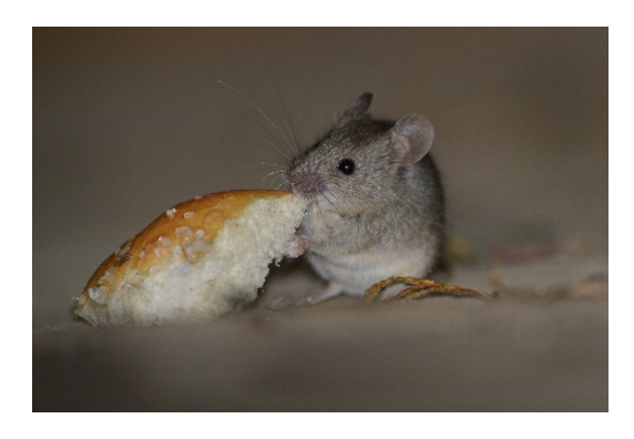
Figure 2. The house mouse breeds rapidly and consumes a wide variety of different foods.

Once indoors, mice establish a home base close to food and harborage opportunities that provide shelter and warmth.