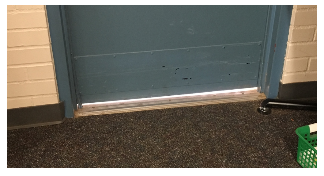
Figure 8. Light "leaks" around doorways are indicators of "open" doors for house mice.

3. Look for light "leaks" around doorways as indicators of "open" doors for house mice (Figure 8). Use correctly installed door sweeps to make all external doors mouse-proof. High-quality, brush (e.g. Sealeze®) or baffle (e.g. Xcluder®) style door sweeps close the gap between the threshold and the door base.