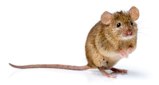
Figure 1. Adult house mouse.

The house mouse (Figure 1) is a troublesome pest and the most commonly encountered rodent in homes in the United States. House mice breed rapidly, eat many different kinds of food (Figure 2), need little or no water, and adapt to different and changing evironments. In homes they feed on human food contaminating food and kitchen surfaces with droppings and urine (Figure 3). They chew on electrical wires, burrow into furniture and chew on wooden beams causing structural damage. House mice can also spread disease causing pathogens and parasites to humans and pets, including the bacterium Salmonella which is a common cause of food poisoning, the fungal pathogen that causes ringworm, and a number of mites, tapeworms and ticks. Their urine contains allergens that circulate in the air and can be asthma triggers for sensitive individuals. For all these reasons, house mice should not be tolerated inside homes.