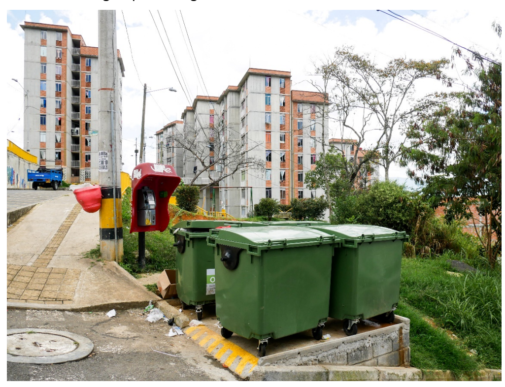
Figure 10. Waste management is an important component in rodent management. Dumpsters should have sufficient capacity to contain all waste and be placed at least 50 feet from buildings.