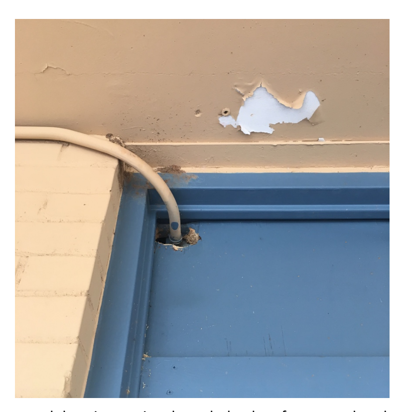
Figure 7. The gap around the wire passing through the door frame needs to be filled.